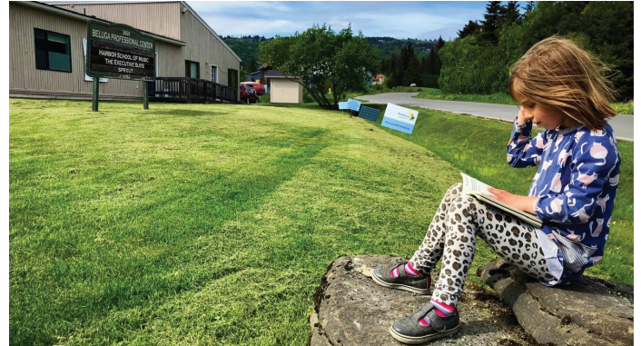
Wellness Challenge Participants