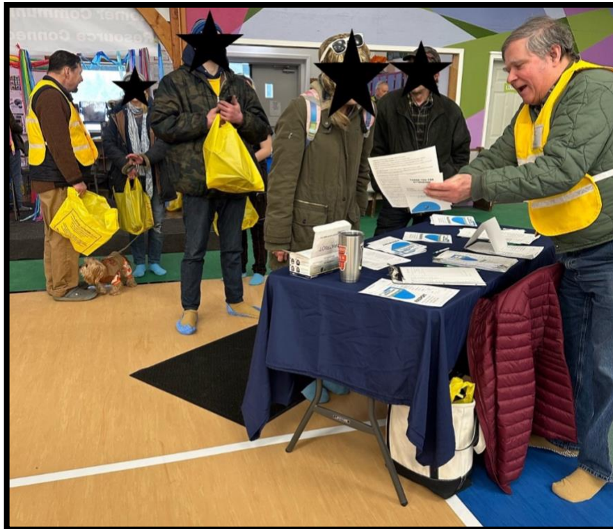
Participants getting oriented at the entrance of the event in Homer.