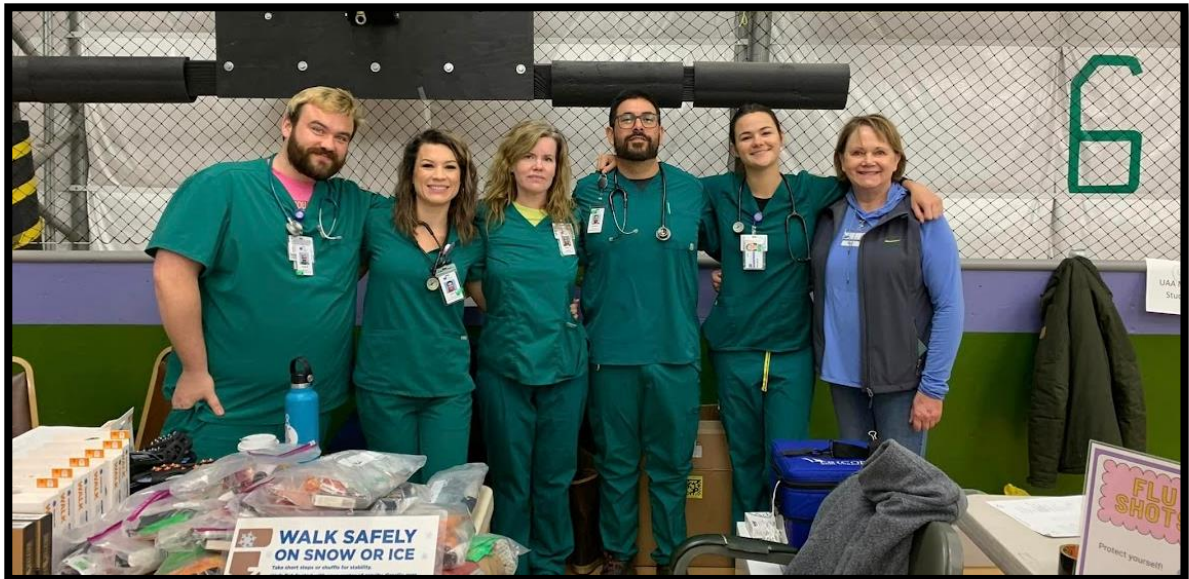
UAA Nursing Students offering health screenings, flu shots, and health education.