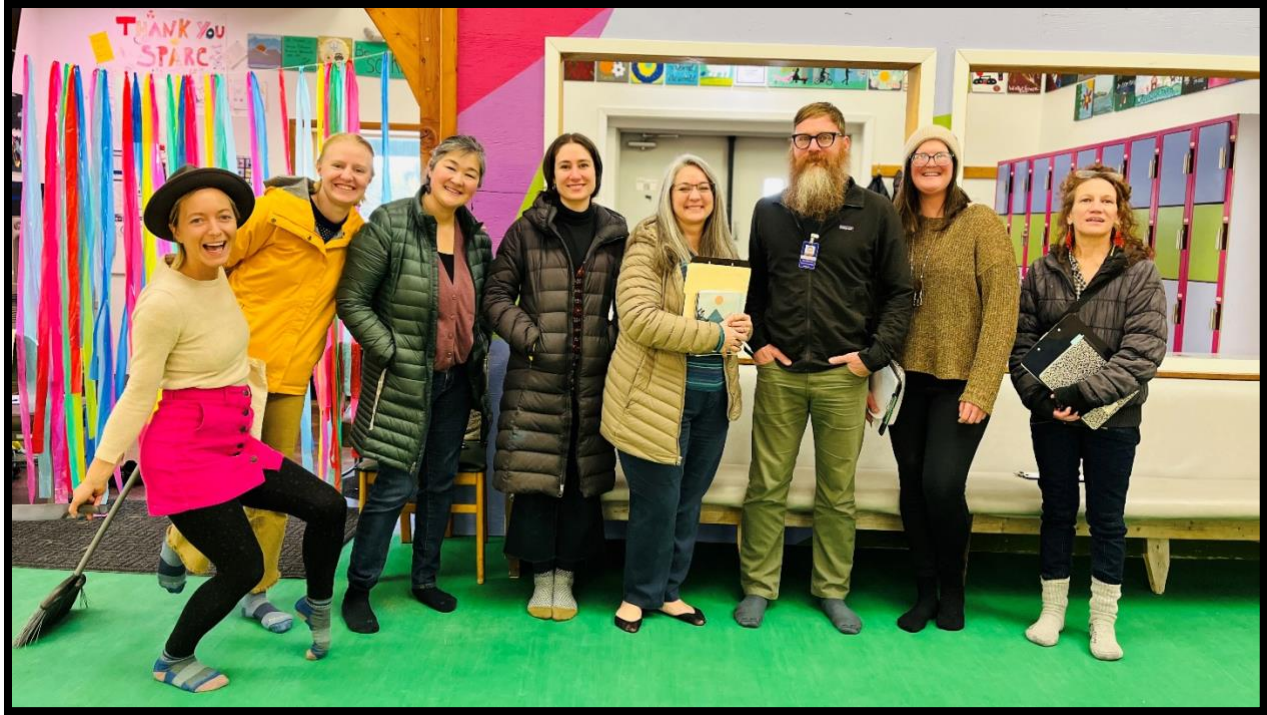
CRC committee members and volunteers