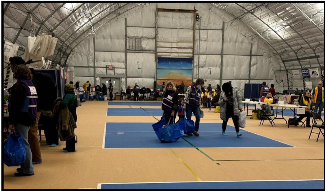
Homer CRC event held at the SPARC