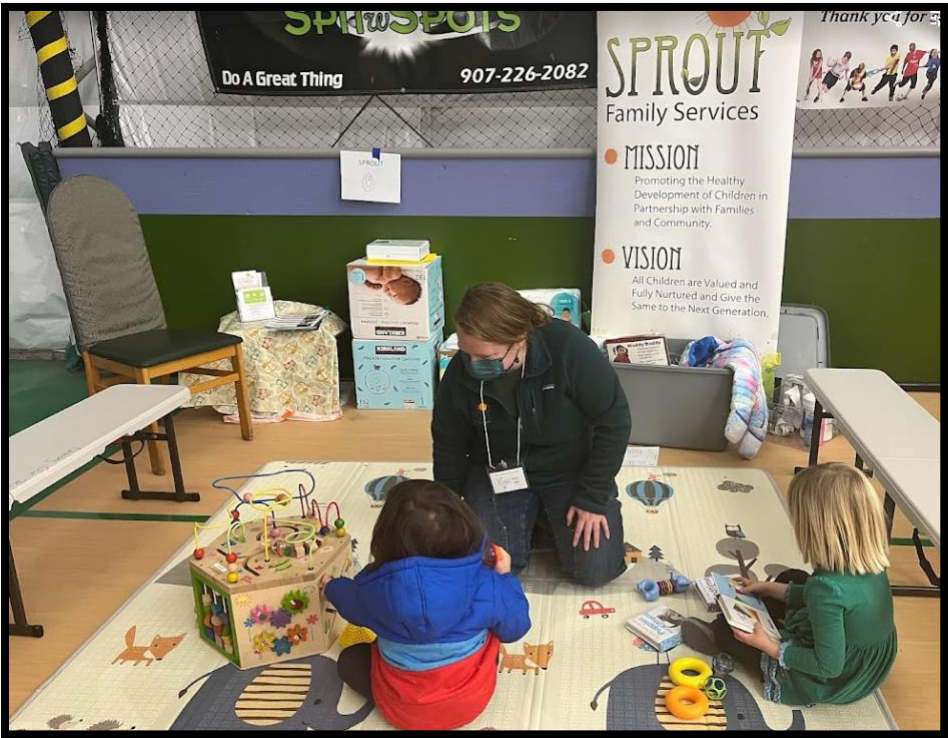
Sprout set up a Kid's Zone to provide childcare on-site so parents could participate in the Homer event.