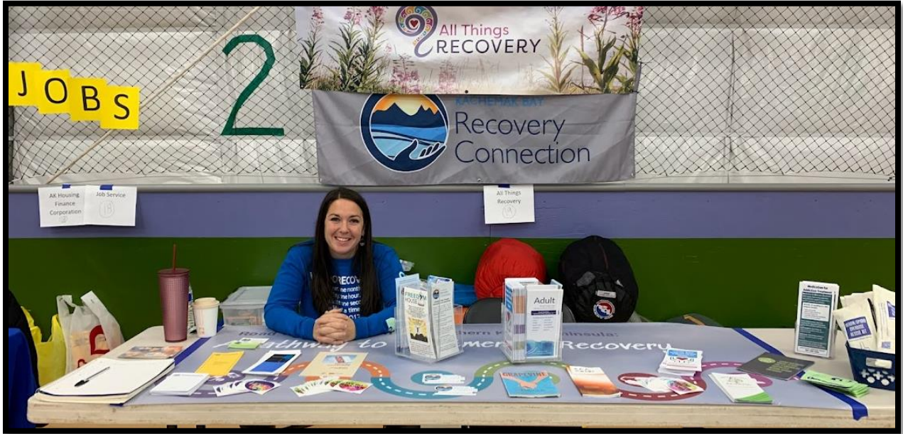
All Things Recovery Table