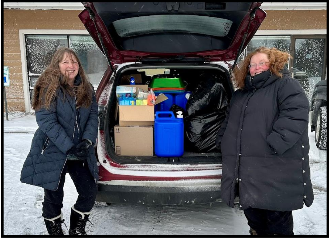
Homer Public Health packed up and ready to head to the Anchor Point Event.