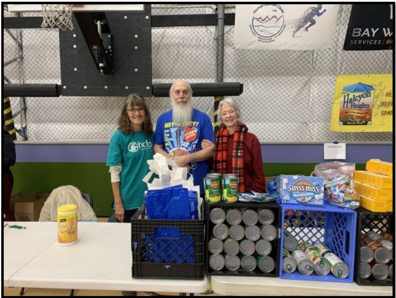
Homer Food Pantry Volunteers