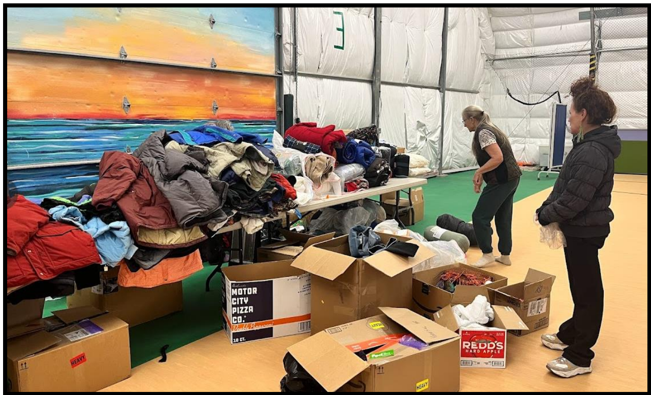
Donations collected through community drives being organized for both events. We live in such a generous Community!