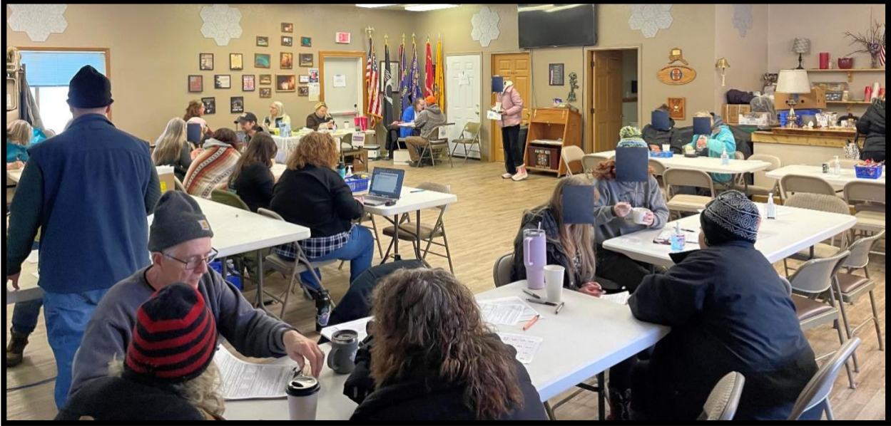
Anchor Point CRC event held at the VFW